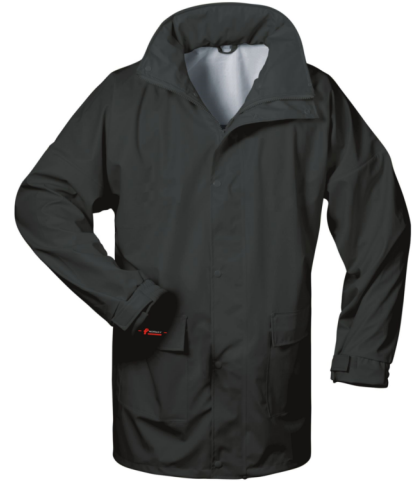
Catalogue Page: 346