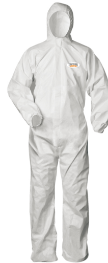
Catalogue Page: 373