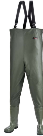
Catalogue Page: 467